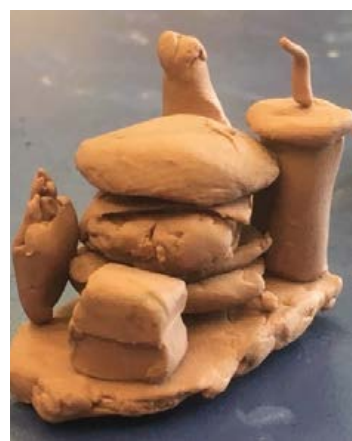
Some Glimpses of Specialist Art Students classroom engagements