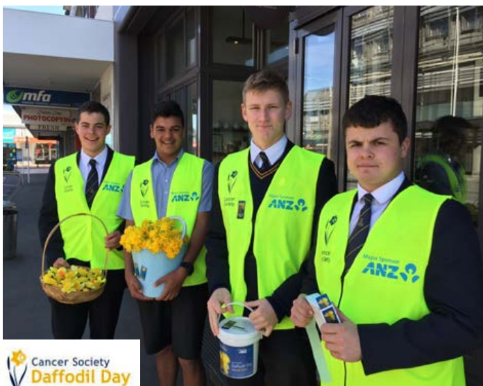
Front Cover - The cast of Evita