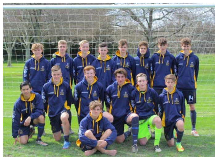
Top: Senior Football Team

Lots of info about school sport events is on the school app or school facebook page.