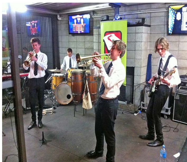
Southern Jam MBC Combo

Marlborough once again hosted the annual Southern Jam Jazz Festival in August, when Jazz combos, ensembles and bands from Secondary Schools across the South Island treated the public to a variety of open performances at venues throughout the district, played for assessment by a talented panel of judges and learned from each other over the course of four days. The festival culminated in a performance at the ASB theatre where each participating school played and an All Stars band was selected.