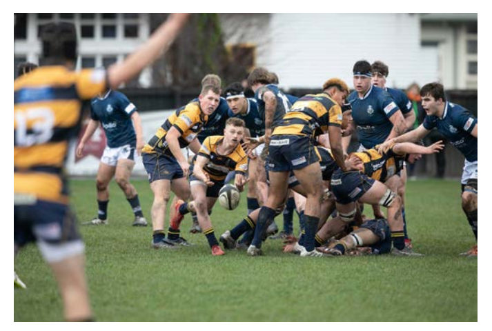
First XV playing at St Andrew's College, Christchurch