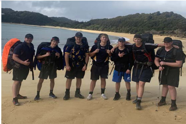
The Year 13 Outdoor Education boys out and about walking one of NZ great walks - The Able Tasman track. They encountered an interesting mix of weather but soldiered on!

This performance will be a medley of musicals (music and drama) which will showcase the students' many talents and provide some comic relief. Keep an eye out for the advertising which will give a list of performance numbers.