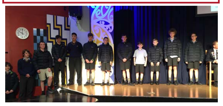
Ōpaoa Assembly - Students who scored 100% for Senior Work Review and Junior Diploma for term 1 and term 2